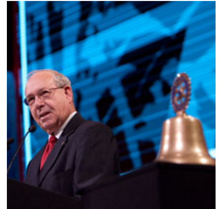
Ray Klinginsmith addresses the attendees at the fourth plenary session on 24 June after delegates elected him the RI president for 2010-11.

"I had the good fortune to travel 16,000 miles in Africa and to visit 35 Rotary clubs in four different countries, and therefore, I am pleased to stand here today as a product of The Rotary Foundation," Klinginsmith said.