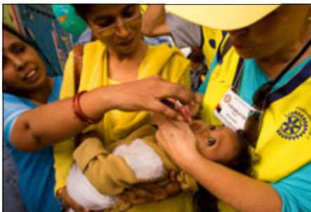
Rotarians partner together on National Immunization Day in Moradabad, India.