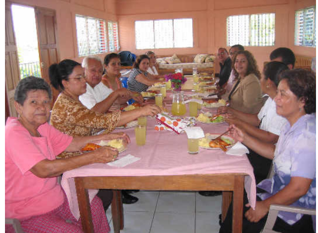
Members of the Rotary Club of Nicaragua have lunch at Casa Materna and tour the new addition. Furnishings are being funded by a combined effort of our Club and Matagalpa.